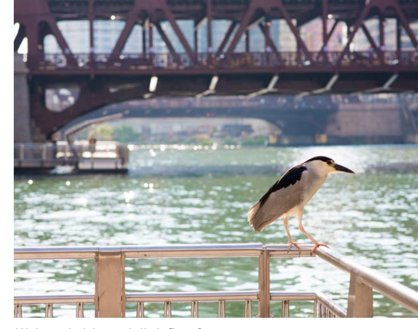
A black-crowned night heron perched by the Chicago River.

It is important to remember that projecting the future is always difficult and that there are inherent uncertainties when doing so. However, if the Chicago River system is restored and turned into a blue/green corridor, it is anticipated that similar projects along the river will have similar returns as those detailed in this report which will create a large impact on the local economy. With smart planning, the municipalities along the Chicago River system can begin their next stage of development, protecting their beautiful river asset, while also sustaining economic growth.