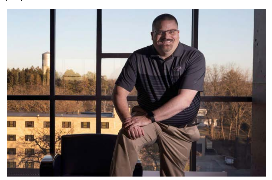
GOAL: The physical security needs of the residence halls are more than minimally met. The greater challenge is encouraging the human element to utilize the tools already available. Human error and indifference create the majority of the physical security issues.

<u>Peepholes/Door Viewers</u> - Housing is currently exploring the viability of installing peepholes in all residence hall resident doors.